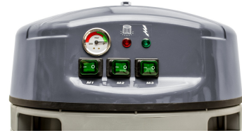
Independent Control for each motor. Pressure Gage and Filter Blockage Indicator