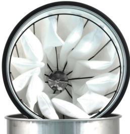
Star Shaped Polyester Main Filter