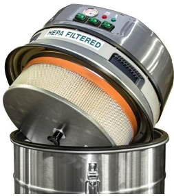
HEPA Filter Cartridge - Optional