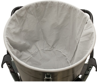
Planet 200 MB Dralon Pre-filter - Included