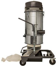
Planet 200 MB side view