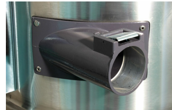
Tangential Suction Inlet, 70 mm, Aluminum