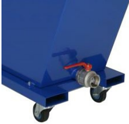
Ø2.5" (Ø64 mm) Manual Drain Valve - Included