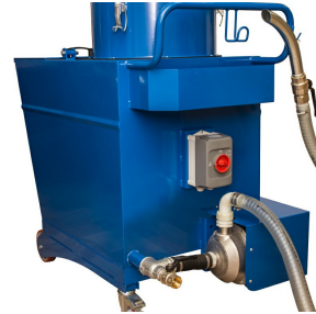
Discharge Pump - Electrically Operated - Optional