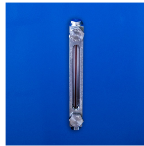
Liquid Level Indicator - Included