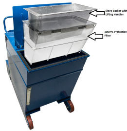
Sieve Basket and 100 PPL Protection Filter - Included