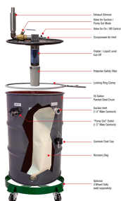
AV1-55 System Overview