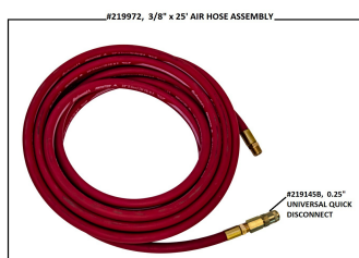
AV1-55 Optional Air Supply Hose