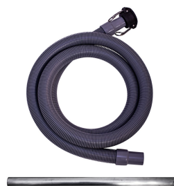
1.5" x 10' Crushproof Suction Hose and 24" bulk pickup wand included