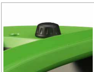
SPEED AND NOISE REGULATOR