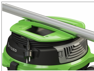
ERGONOMIC HANDLE WITH INTEGRATED CORD WRAP