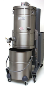
CD-100L (DT) EX (MFS) with Recovery Tank removed