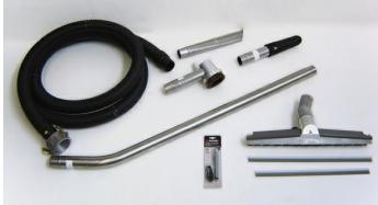
Ø2" (Ø50 mm) Static Dissipative Tools and Accessories - Included