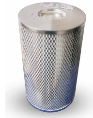
HEPA Filter - Downstream - Optional