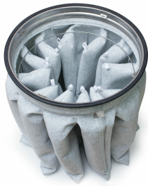
Conductive Star Shaped Filter with Cage - Included