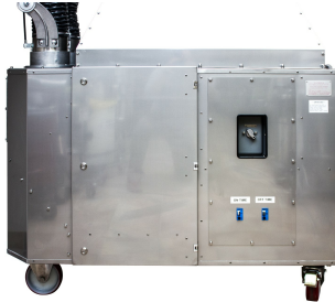
CD-1200 EX STAINLESS STEEL side view