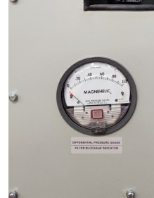
Optional Differential Pressure Gauge (Filter Blockage Indicator) available