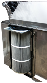
CD-1200 EX STAINLESS STEEL (Filter Cartridges)