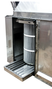
CD-1200 EX STAINLESS STEEL (Pull Out Dust Tray)