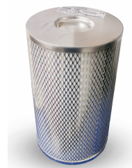
HEPA Filter - Downstream - Optional