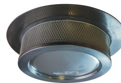
HEPA Filter - Upstream - Optional