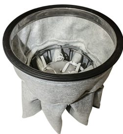
New Star Shaped filter with Manual Filter Shaker