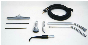
Ø1.5" (Ø38mm) Static Dissipative Tools and Accessories for 1-2 HP Models - Included