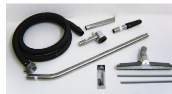
Ø2" (Ø50mm) Static Dissipative Tools for 5 HP Models - Included