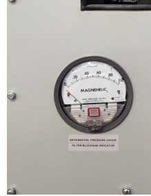
Optional Differential Pressure Gage (Filter Blockage Indicator) available