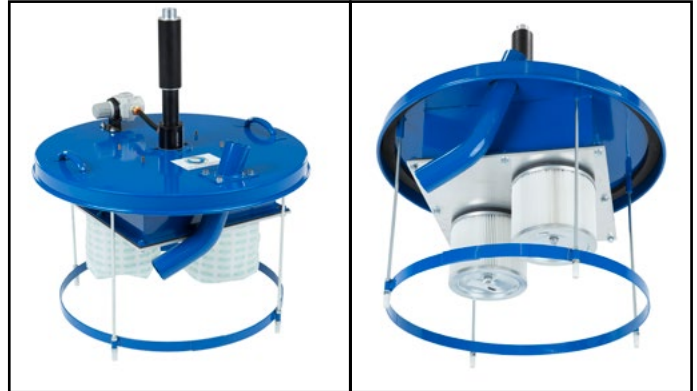
SINGLE-VENTURI VACUUM WITH FINAL HEPA FILTER DT55APH