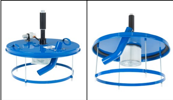
SINGLE-VENTURI VACUUM DT55AP