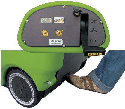
Maximum comfort and extreme ease of use