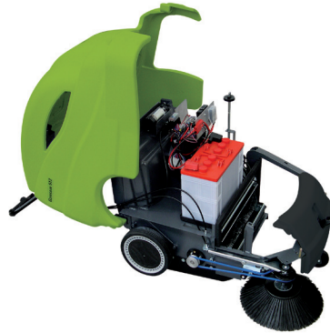
Easy access to internal components Simple to tilt entire top body