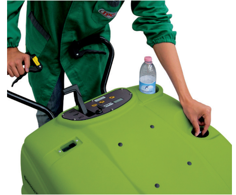
Maximum brush wear saving - Main brush pressure is easily adjusted from walking position