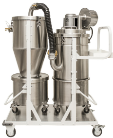
EXP1-20 DT (PRS-HEC) RE HEPA Sideview 1