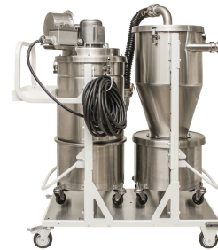
EXP1-20 DT (PRS-HEC) RE HEPA Sideview 2