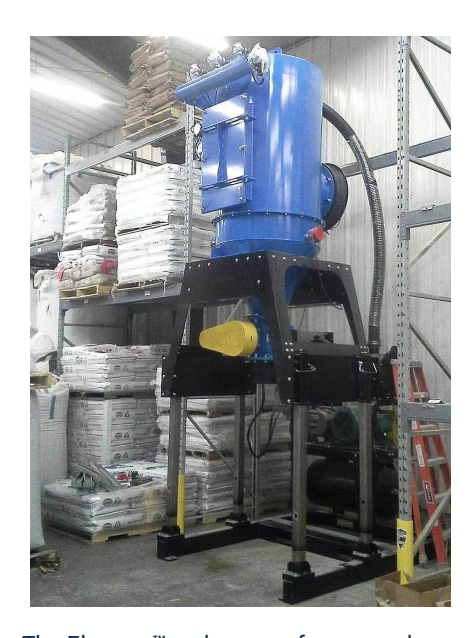
The Elevator \!\!\!^{\scriptscriptstyle{\mathsf{TM}}} makes a perfect central vac.

Let us help you configure a durable industrial vacuum that your workers will actually use.