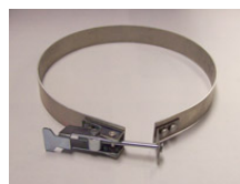
Vent Hose and Clamp for Negative Pressure Vent-Kit