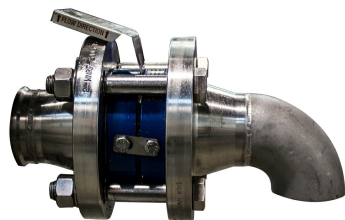
Rupture Disk - Optional