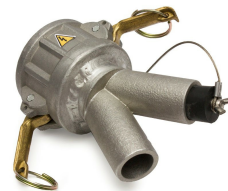
Wye Connector - Included