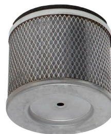
Coalescing Filter Element (CFE) - Included