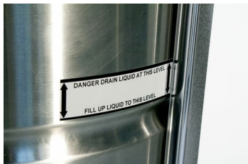
Liquid Level Indicator Tube - Included