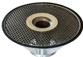
Cone for Interceptors - Included