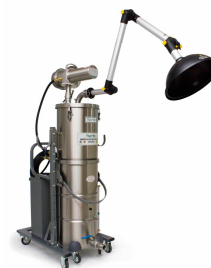
Optional Dust Extractor Arm