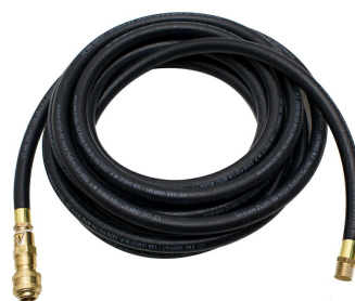
Air Supply Hose Assembly, Static Dissipative and Conductive - Included