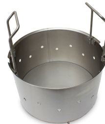
Sieve Basket - Included