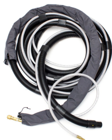
Suction/Airline Hose Assembly, Static Dissipative and Conductive - Included