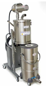
SS-IT (85L) EX (CFE) HEPA with Recovery Tank removed