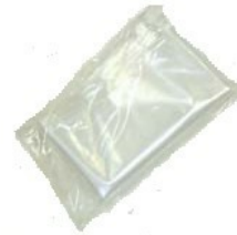
Clear Polyliner Recovery Bags - Included