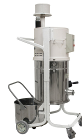
TV-25L (DT) MFS with Recovery Tank removed