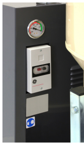
Filter Blockage Indicator Gage. Manual Starter with Overload Protection