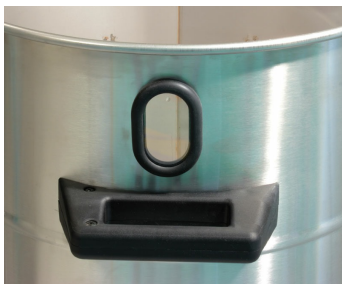
Sight Glass on Recovery Tank