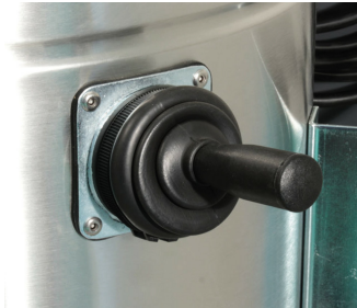
Side Mounted Manual Filter Shaker