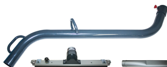
70 mm static conductive tool kit - Included