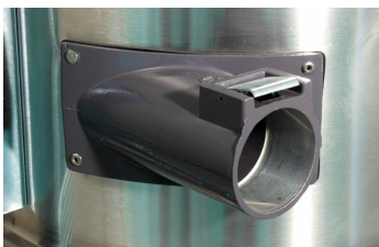
Tangential Suction Inlet, 70 mm, Aluminum