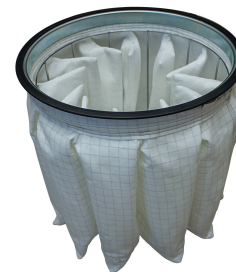
Conductive Star Shaped Filter with Cage for ORDLOC 652 - Included