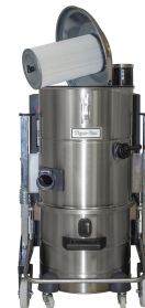
HEPA Filter - Included